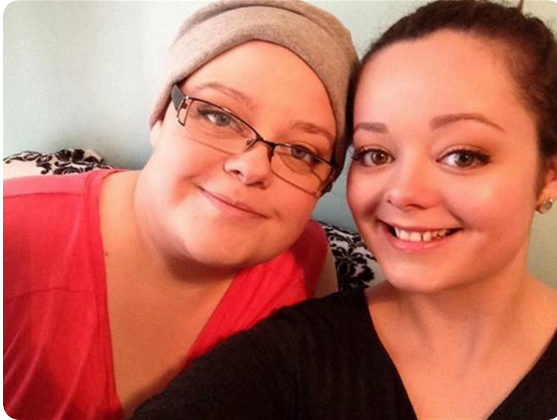
mother and daughter